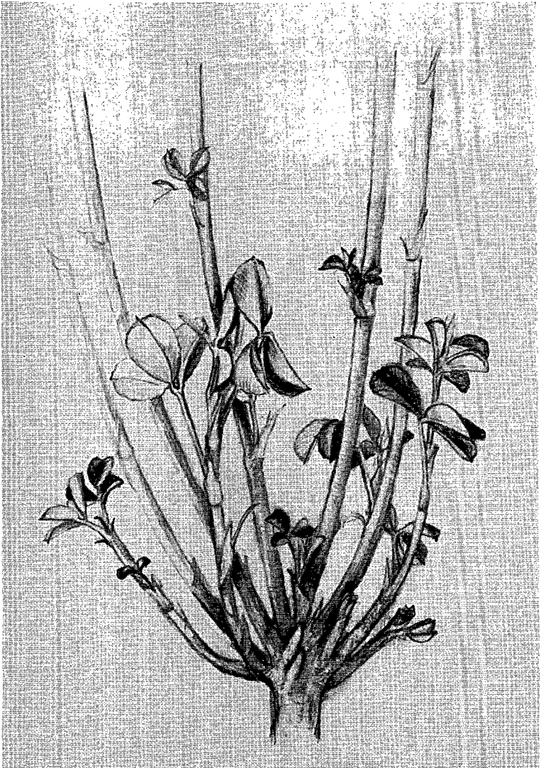
FIG. 1: Basal portion of a young lucerne plant showing (a) Mature stems with shoots arising from axillary positions, and (b) Young shoots and buds growing from the crown.

The crown is a very complex and ill-defined part of the plant. Initially it is made up of the first few branches