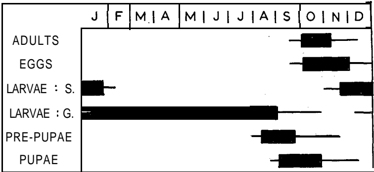
B. LIFE CYCLE WISEANA CERVINATA.